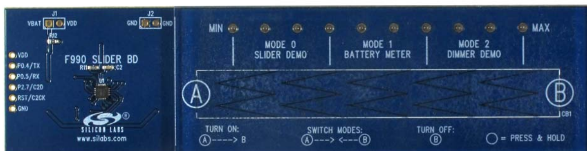
Figure 1. C8051F990 Slider Evaluation Board

User interfaces that use capacitive touch technology require very few external components and can be very simple to design as long as a few basic rules are followed. To demonstrate the simplicity of such designs, we will use the F990 Slider Evaluation Board shown in Figure 1 as an example.