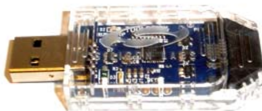
Figure 8. Toolstick Base Adapter (P/N Toolstick_BA)