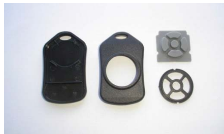
Figure 6. Key Fob Plastic Case (Translucent Grey) (P/N MSC-PLPB_1)