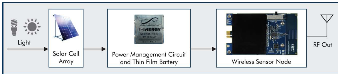
Figure 2. Typical Energy Harvesting System

An important consideration in the development of an energy harvesting sensor node is to ensure that there is always enough energy available to power the system, as shown in Figure 2.