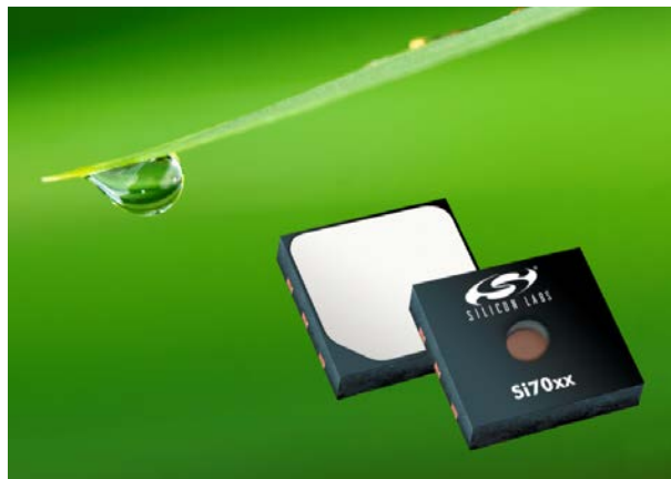
Figure 1. Integrated Si701x/2x Relative Humidity and Temperature Sensors

With the availability of integrated RH and temperature sensors such as the Si701x/2x sensor family from Silicon Labs (see Figure 1), high-precision humidity and temperature sensing capabilities can be added to electronic designs in a simple and cost-effective manner without the need for special calibration equipment, increased design complexity or a large bill of materials.